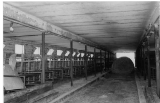
FIGURE 5: Interior View of a Richmond Milkshed Dairy Barn. Poland Dairy Farm, 2003

Gambrel roofs and milk houses were standard in Strauch’s plan. The barn’s ventilation design, usually manifested as rectangular vents under the windows, represented a simplification of the King and Rutherford dairy barn ventilation systems that were popular among agricultural engineers of the period. Strauch’s plan also called for a T-shaped open-air breezeway that separated the cow stable from the milk house. The concrete-floored breezeway facilitated ventilation and cleaning and doubled as a storage area for equipment. The design also permitted the extension of the hay mow over the milk house, feed room, and breezeway; this allowed for all-weather transfer of hay from a wagon parked in the breezeway through a trap door in the hay mow (Pezzoni 1999). Strauch’s dairy barn plans, as outlined here, were not dissimilar to the national standard. They were, however, modified to make them more suitable to their region, as was suggested by national-level publications. Few of the surviving dairy barns in the Richmond milkshed have these particular features.