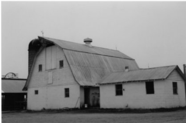
FIGURE 4: Exterior View of a Richmond Milkshed Dairy Barn. Hatcher Dairy Farm, 2003

The building was to be at least thirty-four feet wide, for a double row of cows, allowing a width of three and one-half feet per stall, with four square feet of light and two square feet of ventilation for each stall. We use the diffusion system of ventilation, which consists of a number of openings cut in each side of the barn, each opening one foot wide and two feet long, about two and one-half feet from the ground, all covered with muslin. Each stall has one of these openings in front of it. The plans called for at least 500 and more than 800 cubic feet of air space per stall. The stalls, floor and mangers were to be of concrete, and the stanchions, stall divisions, and posts of iron. This type of barn would be our standard barn [Strauch 1923].